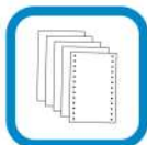
Higher copy capability