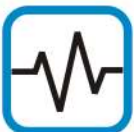
200 Million Character Print Head

* Max. possible copy capability ** At 10 cpi draft # @ 33% print density and 25% duty cycle ## Excluding print head @ 33% print density and 25% duty cycle. 1 kg = 2.2 lbs; 1 inch = 2.54 cms